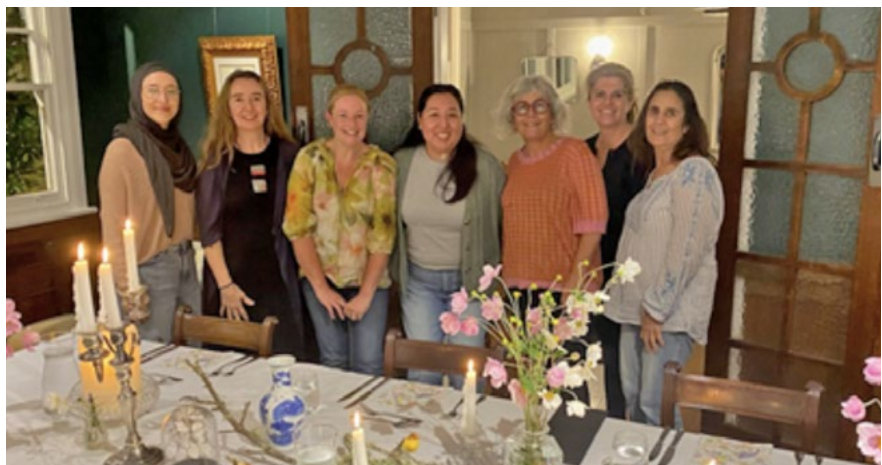
CASAC Conference, March 2024